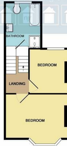
1ST FLOOR APPROX. FLOOR AREA 398 SQ.FT. (37.0 SQ.M.)